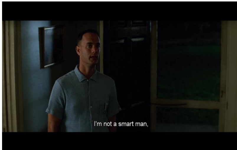
Figure 4. Forrest's confessing his love

you. In actual social life we must often find conditions where someone is desperate, and feels useless to be born in this world. With this advice we will become more aware of the opportunities we can create. This advice becomes more powerful because the story presented is a child who has many limitations mentally and physically, but he can still survive and even achieve big things in his life. For those who experience the same fate regarding mental and physical limitations, of course it will be very motivating to follow and do the same as a Forrest. And for those who have luck with physical and mental perfection, of course, will be motivated not to be lazy and start chasing their dreams and doing good things.