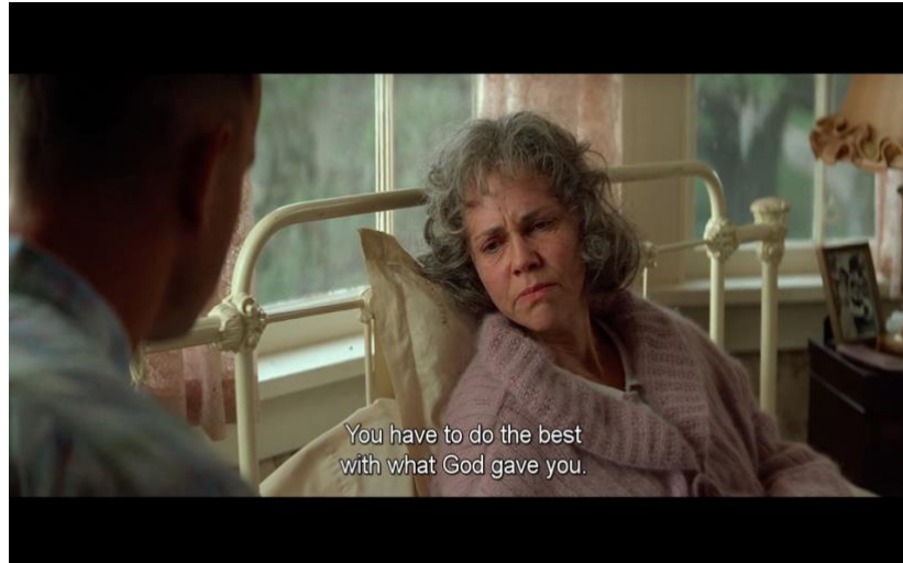
Figure 3. Mother's giving advice to Forrest

In the situation described above, Forrest's mother even sacrificed her pride for her child. He was willing to do whatever the principal said so that Forrest could enter the school. Of course this is an irony of social life that occurs. Many people in this world try hard to get what they want but sometimes use bad ways.