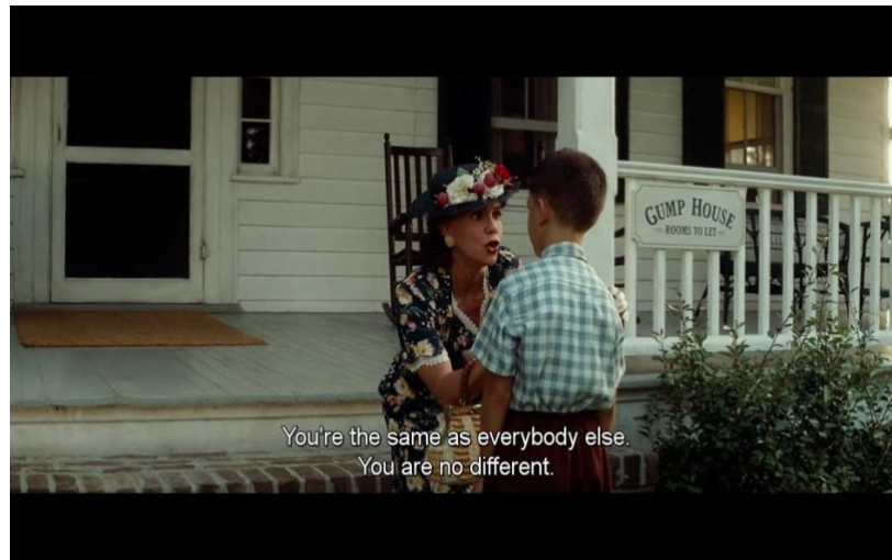
Figure 1. Mother's talking to Forrest

In this study, purposeful sampling is used, which is a sampling approach that is carried out intentionally or not randomly by setting certain criteria for the sample data needed in this study. As a result, based on the specified criteria, the researcher selects the data sample to be collected. As a result, only samples of data relevant to the research problem were used in this study, namely quotes from words or sentences and visual descriptions of social situations in Forrest Gump .