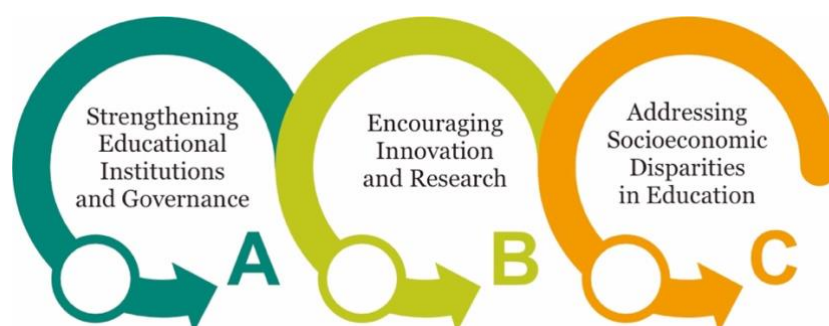
Figure 4: Strategic Steps to Improve Education Economy

Figure 4 provides a more complex explanation regarding the urgency of a comprehensive approach to encouraging economic development through creative education, which involves more than just changing labels. This approach includes providing resources, infrastructure, training, and collaboration with various parties to encourage innovation and entrepreneurship. Evaluating traditional cultural educational institutions in Bosnia and Herzegovina is essential to identify their specific barriers and needs in carrying out innovation activities. These assessments can inform targeted interventions and policies, invest in innovation capacity, and foster an ecosystem that supports creative education.