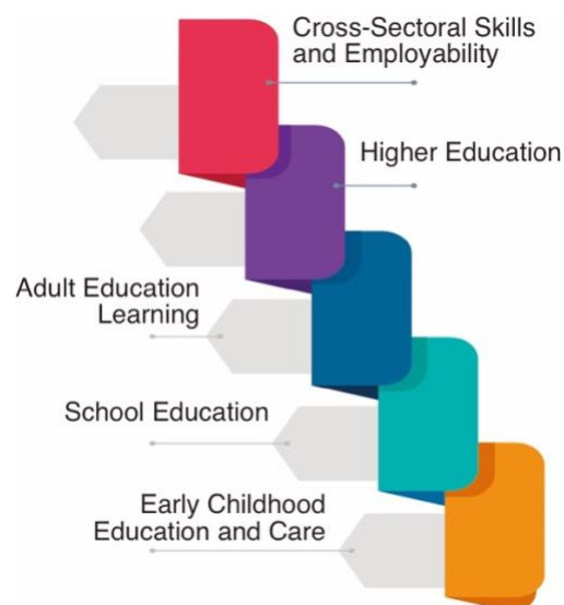
Figure 3: Education Development Priority Policies

Figure 3 shows aspects of ongoing policy reforms and developments are grouped thematically in priority sections, which are hierarchically described as follows: Early childhood education and care; School education; Adult education learning; Higher education; Cross-sectoral skills and employability.