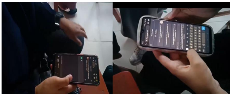
Figure 3. Students engaged in learning through ChatGPT

Regarding the ability to obtain information with ChatGPT, 60.89% of respondents rated it excellent, while 39.13% considered it good. This finding aligns with the statements of the surveys. The good news is that none of these responses can be considered harmful, indicating support for ChatGPT as a learning tool to engage participants in the online class.